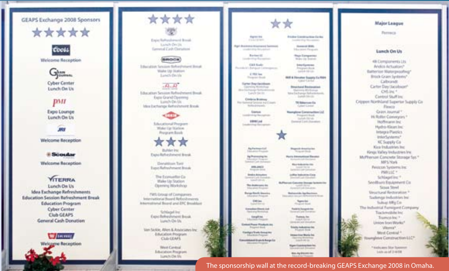
The sponsorship wall at the record-breaking GEAPS Exchange 2008 in Omaha.