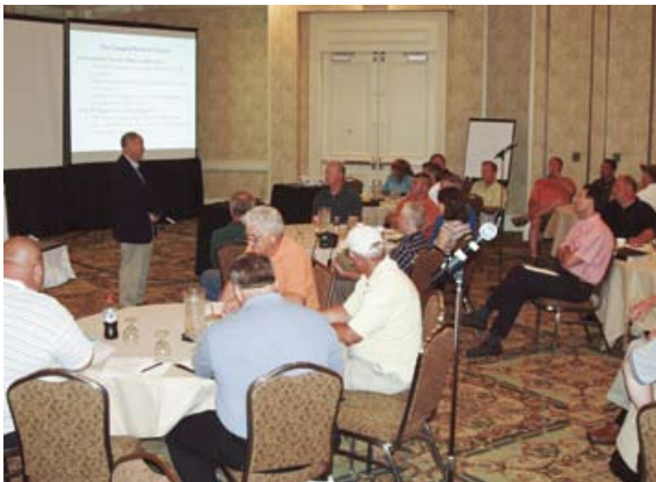
Inside the Chapter Leader Workshop at the 2008 Leadership Conference.