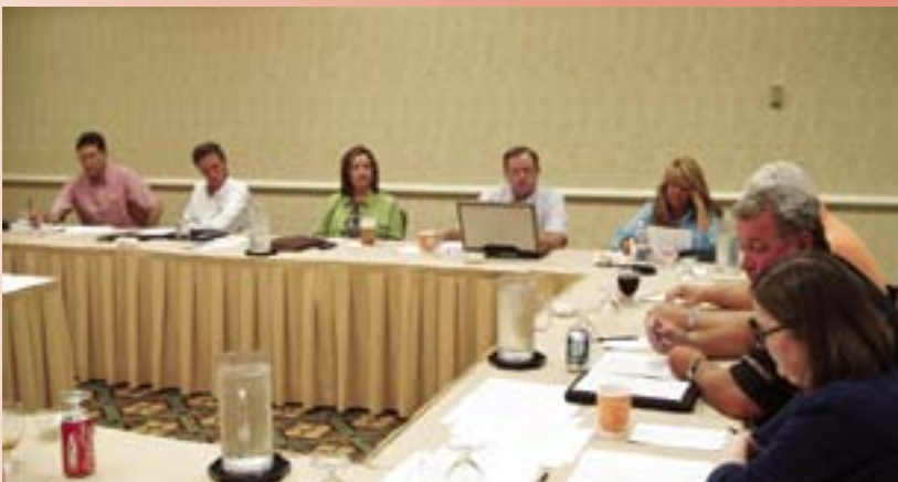
The Membership Committee meets at the 2008 Leadership Conference.