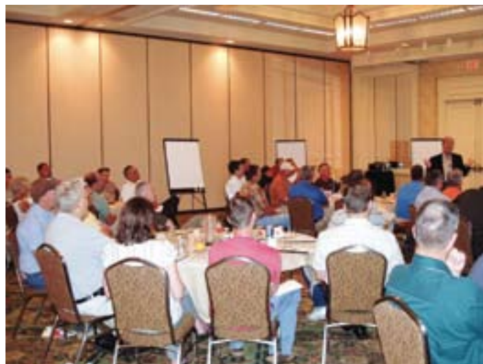
Inside the 2008 Leadership Forum

Archer Daniels Midland (ADM) export facility in Ama, La. for a tour and presentation on export merchandising, logistics and plant operations. The next step of the evening was a dinner of local specialties like fried catfish, seafood gumbo and crawfish étouffée. Dinner was followed by a