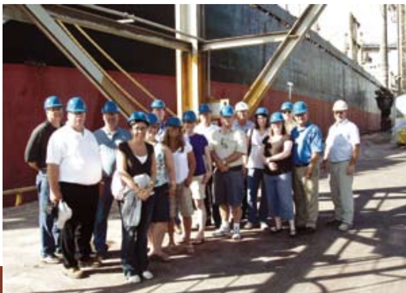
At the ADM export facility tour in Ama, La.

The 2009 Leadership Conference will be held July 7-9 in Winnipeg, Manitoba.